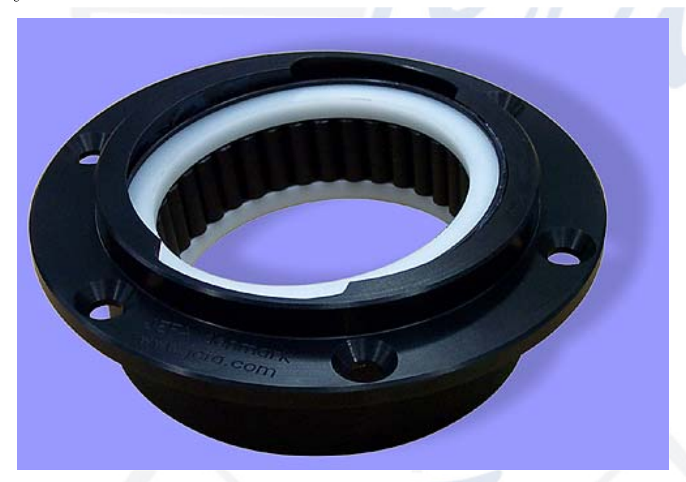
Bénéteau First type self aligning top roller bearing.