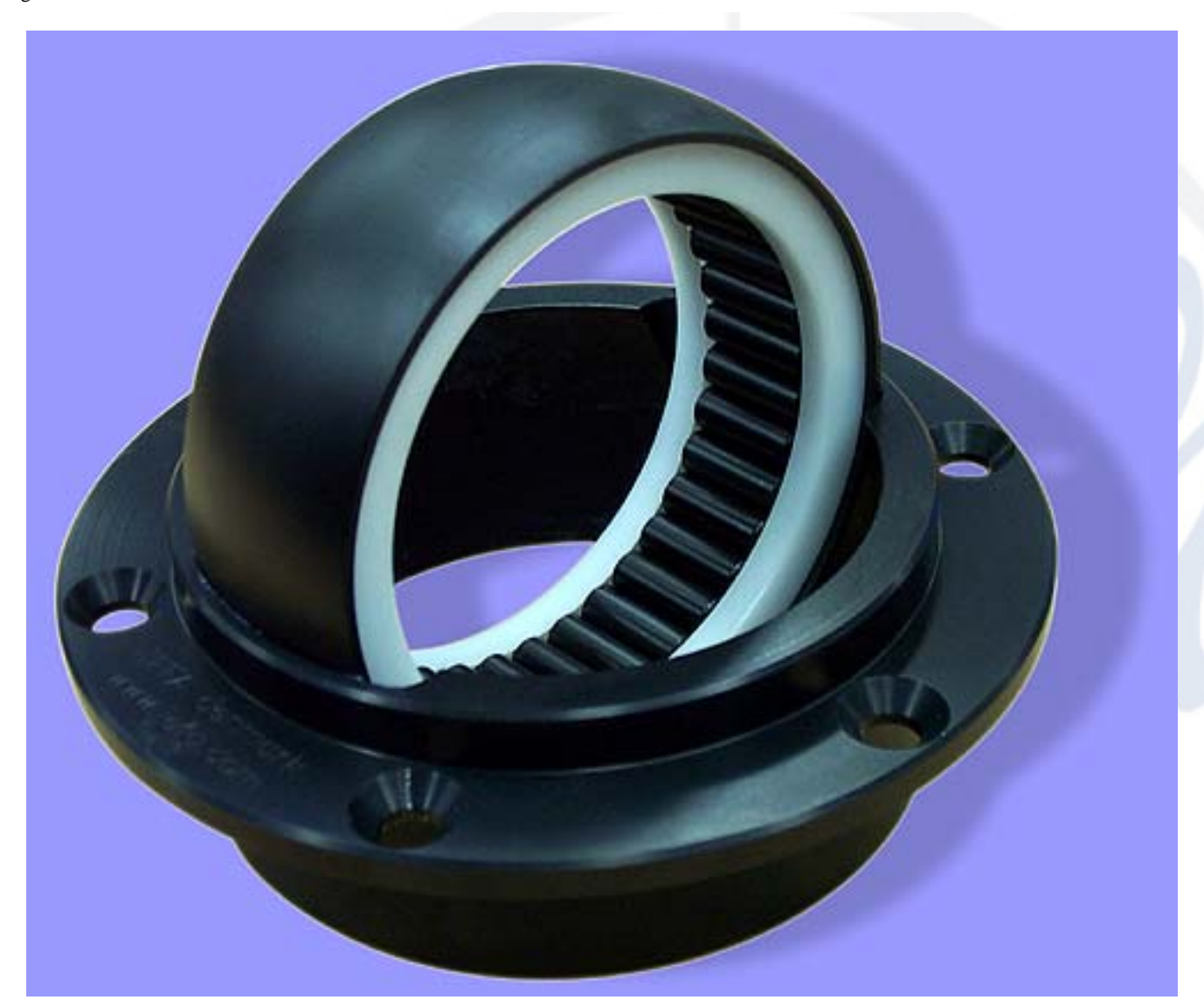
The inner ball is easy removable from the top.